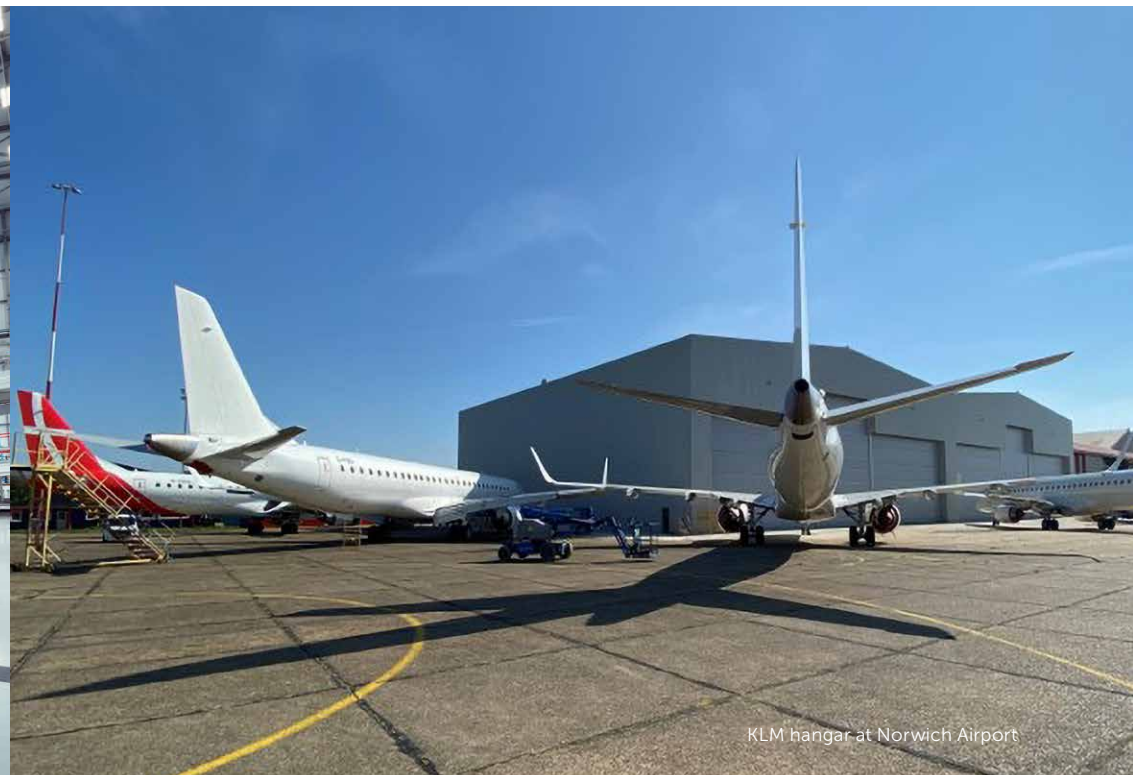
KLM hangar at Norwich Airport